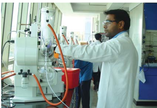
At the drug discovery centre in Pune the focus is on finding new therapies for metabolic, inflammatory and neglected diseases

Thus all project ideas for new research come from the scientists themselves. The winning proposal undergoes external validation before work begins on it. “For the scientists, this is a very big buy-in, and they go all out to make sure it happens as they are the champions of the idea,” says Mr Mookhtiar. This helps