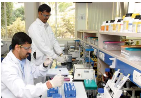
The drug development centre in Bangalore provides services to pharmaceutical, biotech and agro companies